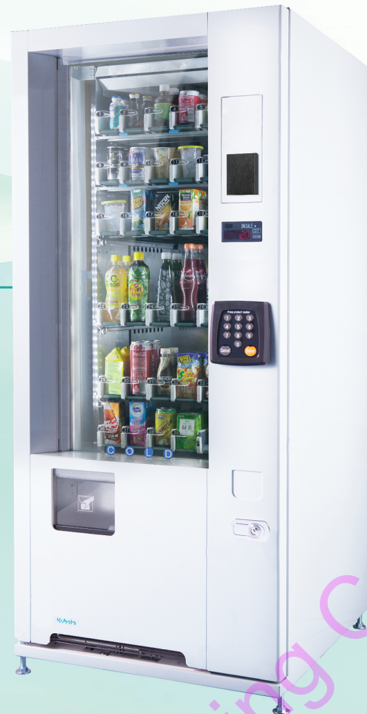
Indoor use only