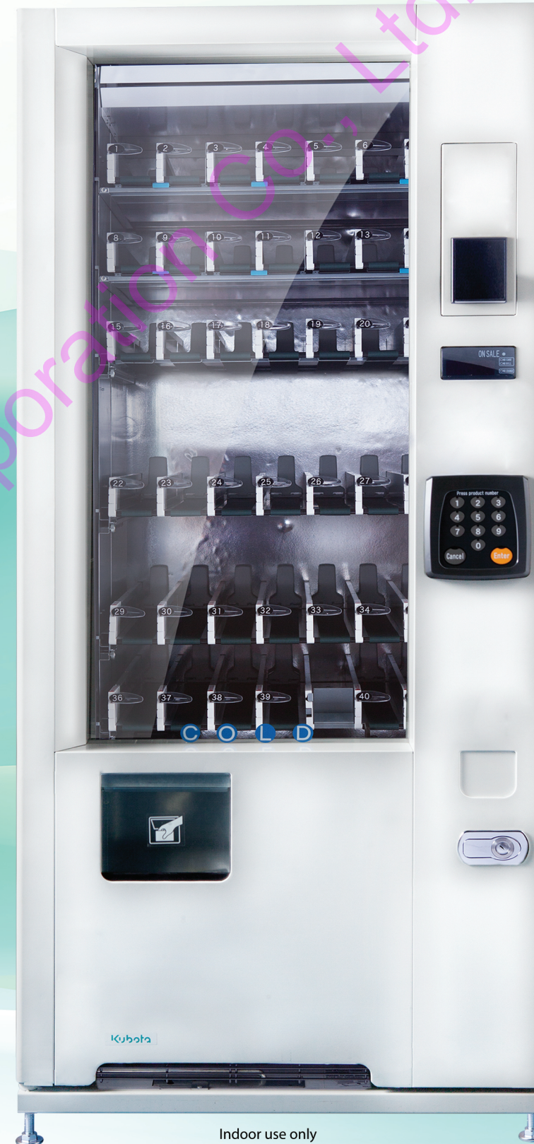
Indoor use only

Kubota Glass Front Vending Machine 41 Selection